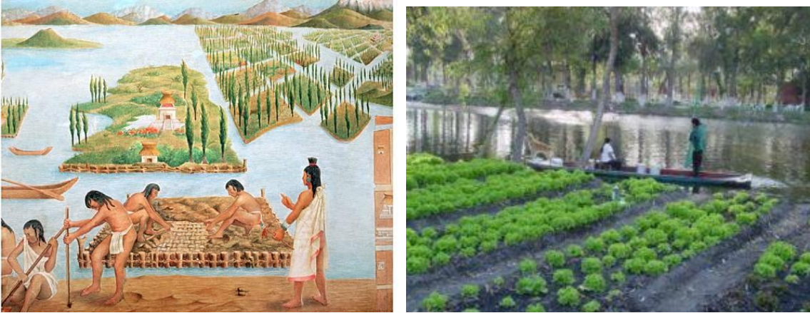
Chinampas – Ancient and Modern