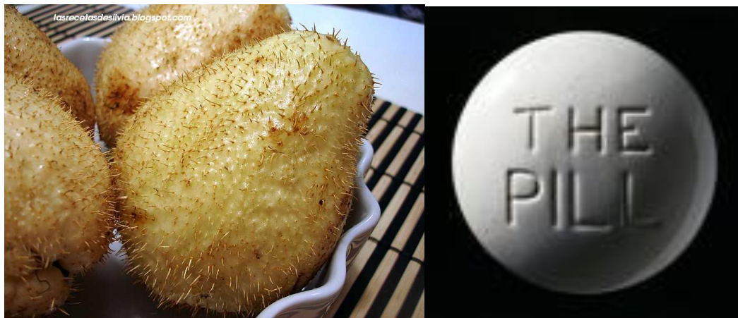
Dioscorea villosa

Western science, had a major development impact in the industrialized societies, in respect of two. There would have been a similar impact, in respect of the third, if that knowledge had been known to the West. I shall begin with an example from our own Latin American and Caribbean region.