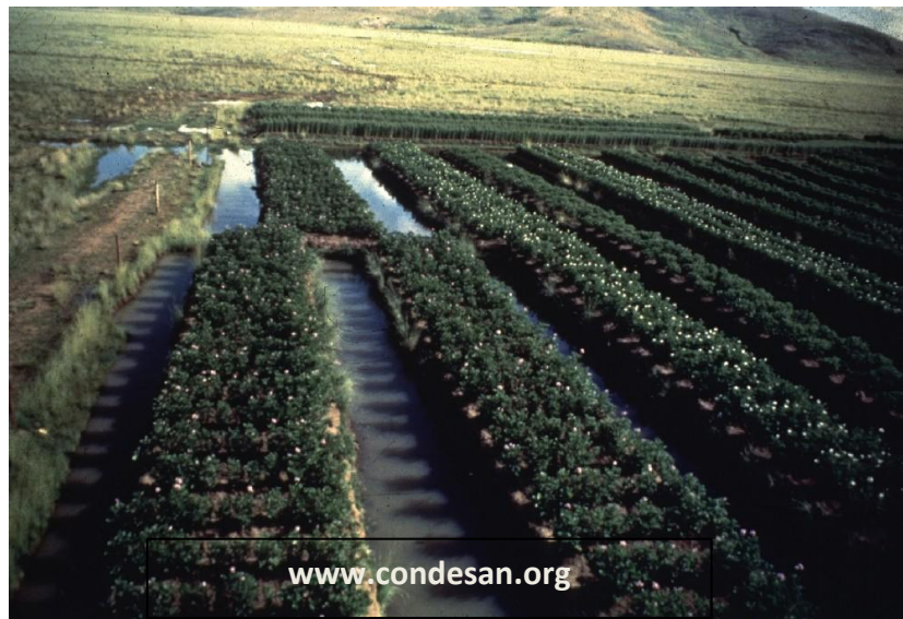
Waru Waru field, Peru

chemically fertilised Pampas soils: « This ancient Inca technology is proving so productive and inexpensive that it is being actively promoted throughout the Altiplano in preference to modern agriculture. It requires no modern tools or fertiliser. The main expense is labour.....to dig canals and build platforms » (Altieri, 1992).