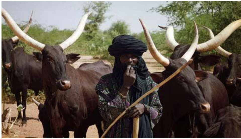
Fulani Herder

period. That remarkable eco-indigenous African knowledge could have been of great economic benefit to Europe, if Western veterinary experts had bothered to find out why the incidence of foot and mouth disease in areas inhabited by the Fulani was lower than elsewhere.