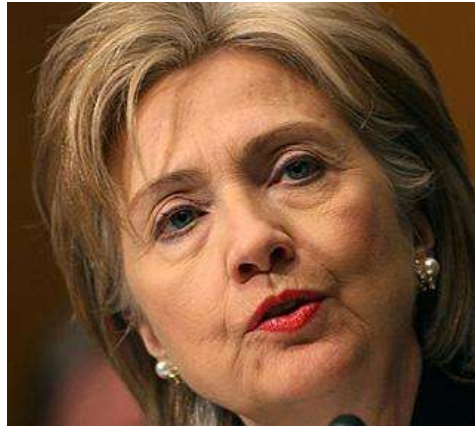
US Warmonger Clinton

Russia whose interests will be affected as a result of the attack against Libya clearly factors in the West's economic reckoning. In fact, Russia already counts considerable losses. Arms deals between Libya and Russia worth $2.2b and $1.3b were signed in 2008 and 2010 respectively but evidently will not go through. Several other contracts between the two countries were in the making at the moment when the international sanctions were imposed on Libya. Libya was expected to buy 12 Su-35 multi-purpose fighters, 48 T-90S tanks, a number of S-125 Pechora, Tor-M2E, and S-300PMU-2 Favorit air