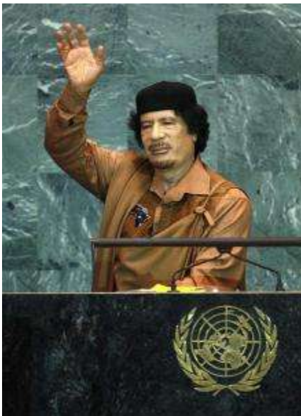
Gaddafi at the UN

Libya ranks first in Africa in human development with the average life expectancy making 77 years (for comparisons, in Russia the average makes 69 years).