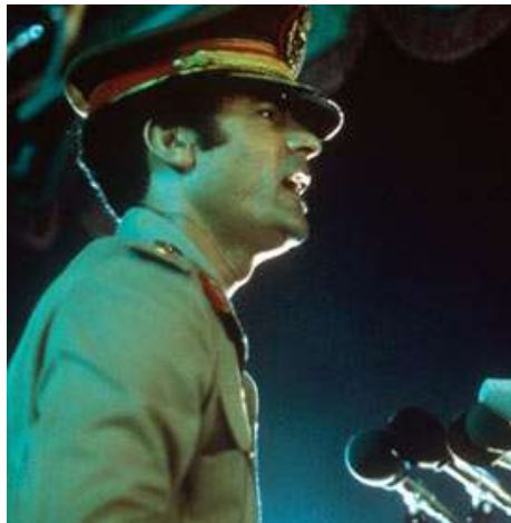
Colonel Gaddafi in 1977

Securing the country's grip over its own economy was a task much more difficult than getting rid of foreign military bases. Libya's financial sector was nationalized by a government decree in 1970 as the